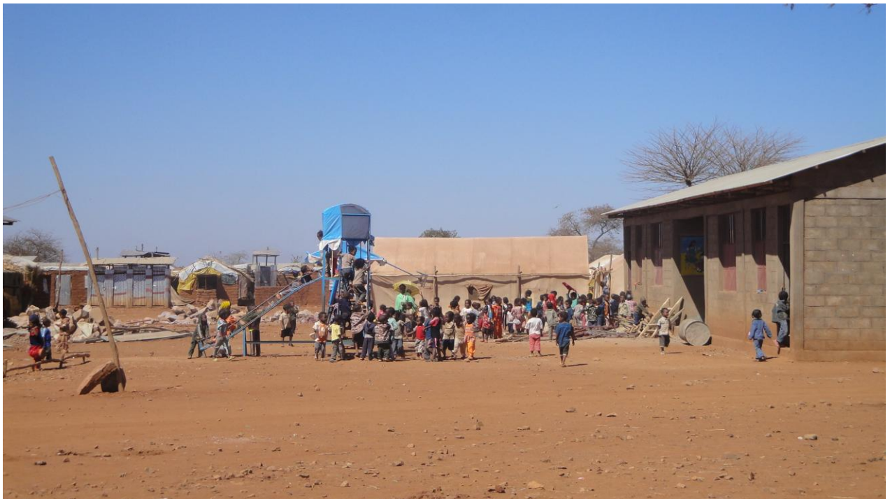
Mai-Aini Refugee camp, Ethiopia, March 2011

The construction of new primary school facilities in Mai-Aini Camp, Tigray Region, Ethiopia